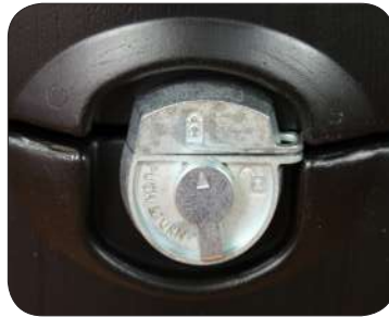
Push & turn locking mechanism