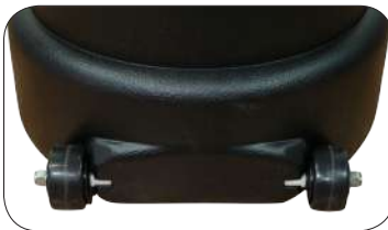
Recessed wheels and handle